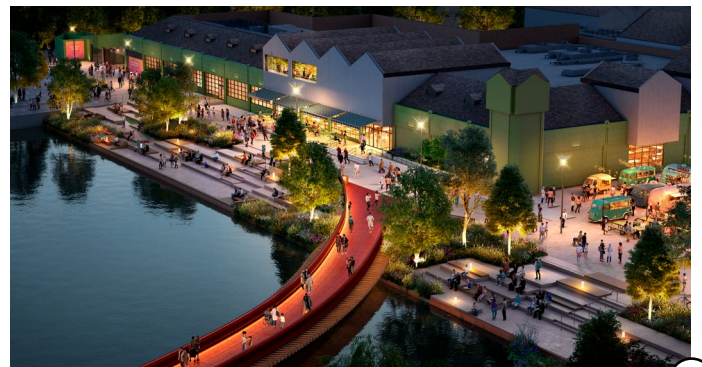
Corner Corner will be a groundbreaking destination ... page 3

From tennis and dance to parenting classes and energy saving tips, our partner organisation Time & Talents has so much to offer the local community. ... page 2