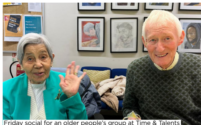
Friday social for an older people's group at Time & Talents