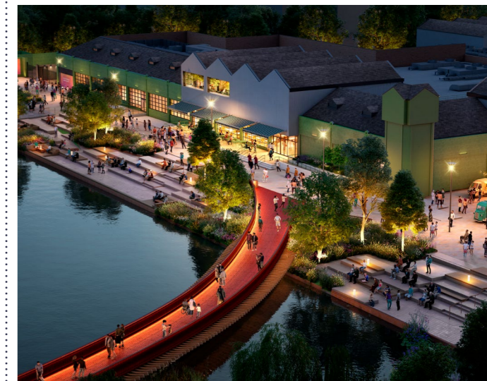
The dockside will be the place to go for food and music

For all the latest including opening, and what's on, visit cornercorner.com